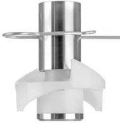
Photo shows cleaner with optional fixing tube